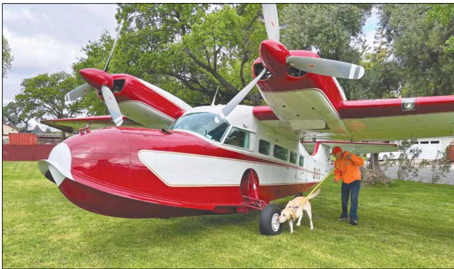
One of the dogs contracted by Lake County for aquatic invasive species inspections inspects a Grumman Widgeon G-44 during the Splash-In.