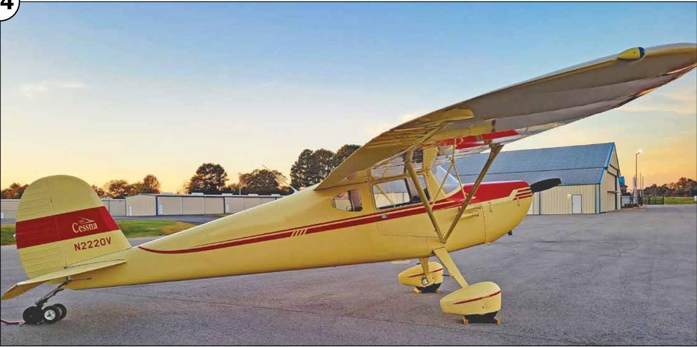
This Cessna 140 is just one of many airplanes Jill Gowen — who encourages everyone to C'mon, let's go fly! — enjoys flying.