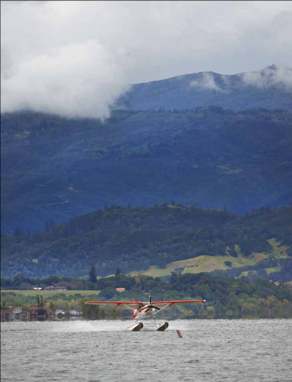
A Cessna 185 on amphibian floats lands on Clear Lake during the Splash-In.