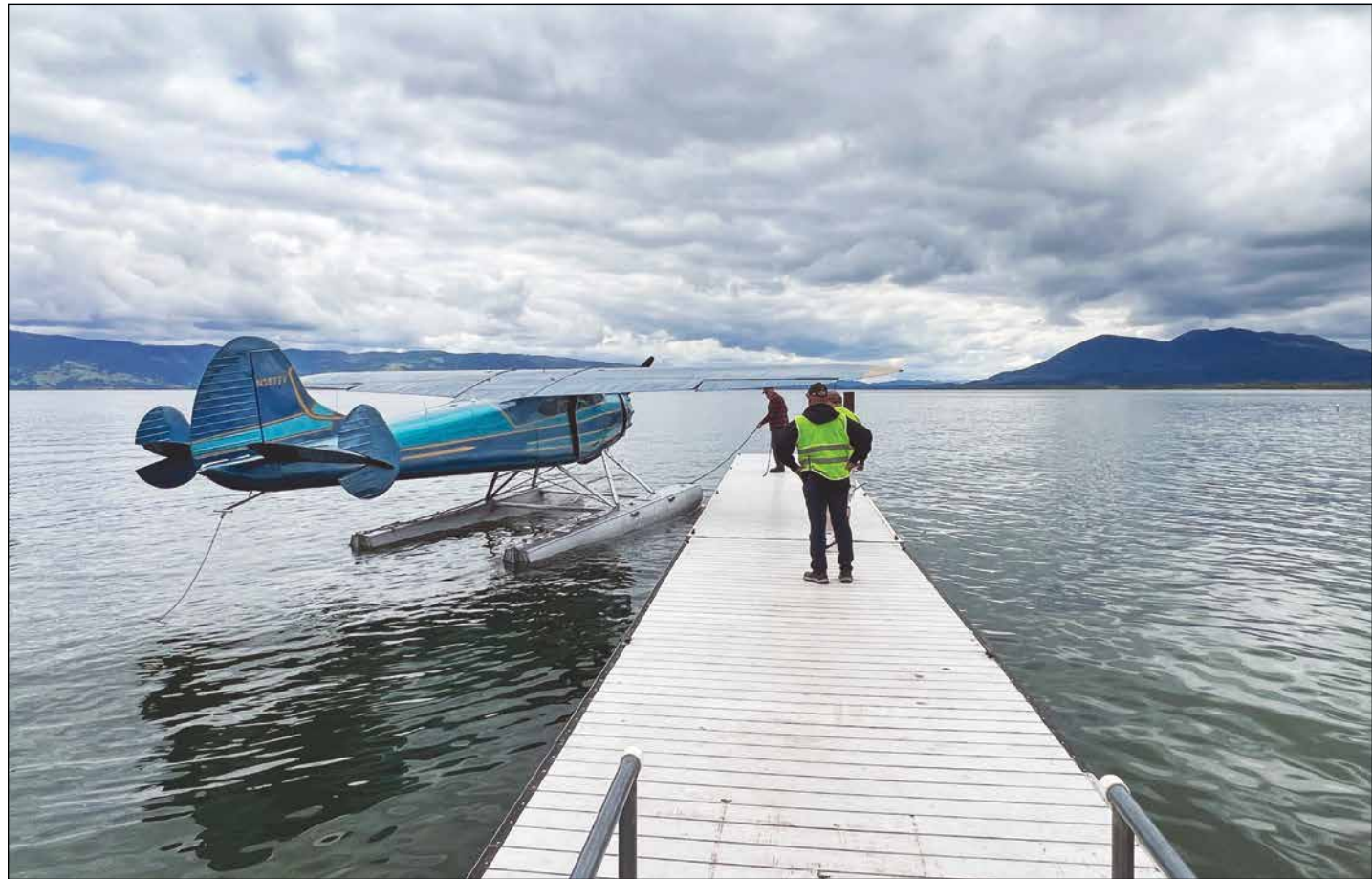
Securing a Cessna 195 on straight floats at the Skylark Shores Resort dock during the Splash-In, with Mount Konocti in the background.