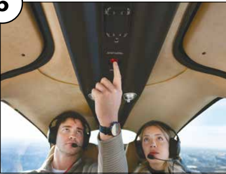
The latest SR series model from Cirrus Aircraft includes a button that passengers can push in an emergency and the plane will automatically fly to the nearest acceptable airport.