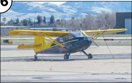
A Stinson Voyager 150 was one of many aircraft photographed during a day at Livermore Municipal Airport (KLVK) in California.