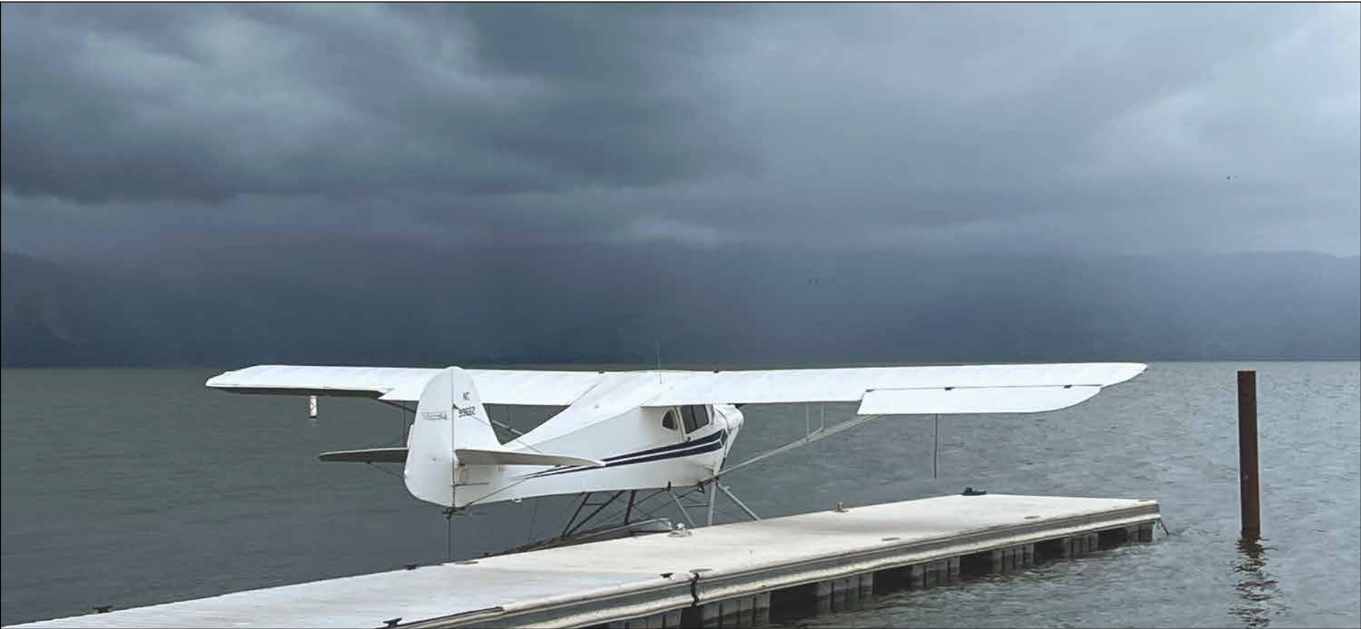
A Taylorcraft BC-12D on Edo 1320 floats docked at the Skylark Shores Resort during a passing shower.